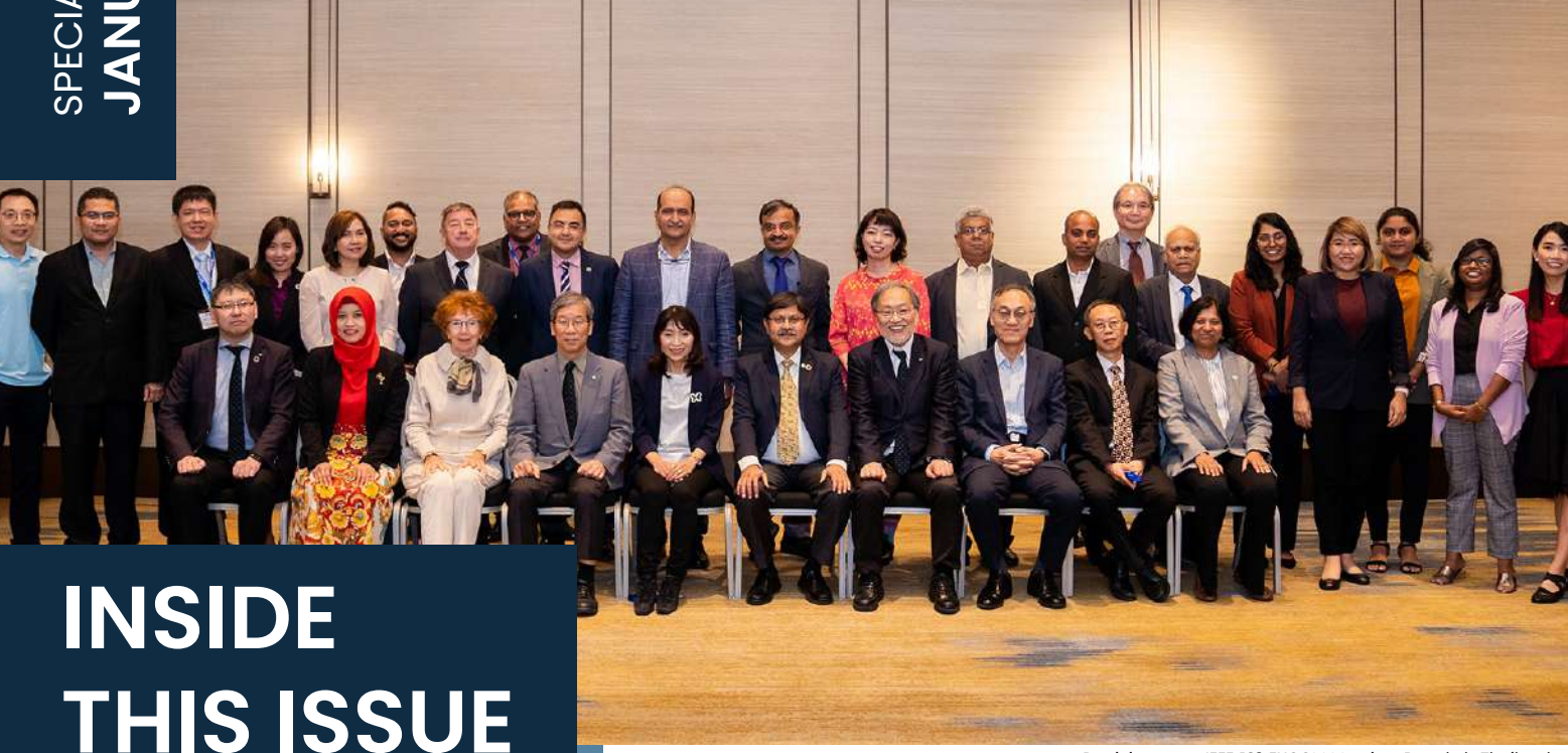
Participants at IEEE R10 EXCOM Meeting, Bangkok, Thailand